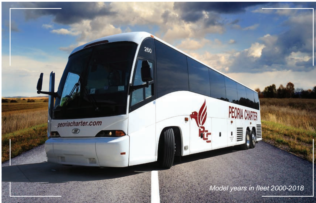
Model years in fleet 2000-2018